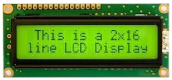
Figure 3: LCD Display

This is the pit fall for beginners. Proper working of LCD depend on the how the LCD is initialized. We have to send few commands bytes to initialize the LCD. Liquid crystal display is also called as LCD is helpful in providing user interface as well as for debugging purpose. The most common type of LCD controller is HITACHI 4478 which provides a simple interface between the controllers as well as are cost effective.